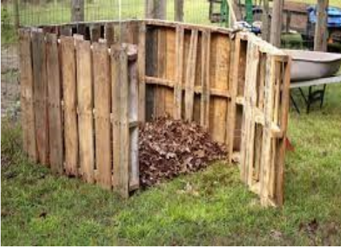
A pallet compost system