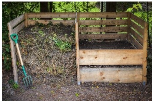
A two-bay compost system

will be tired and need revitalizing.” Again, so far so good – anything that relies on resources becomes depleted when they are used and it will need replenishing. And we know that adding compost to our