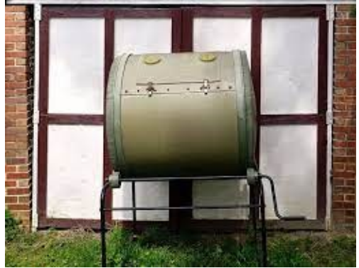
A tumbler compost system

Then, if we know what compost is, why do our gardens need it? A simple answer comes from The Compost Book by David Taylor – “After a season of fruiting, flowering and vegetable production, your soil