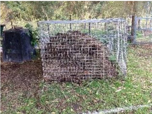
A mesh compost system

soil increases moisture absorption and retention; it maintains good aeration of the soil; it aids soil drainage; it keeps soil temperatures constant; and – most importantly – it feeds beneficial soil organisms.