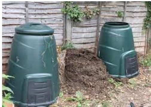
Green compost bin systems